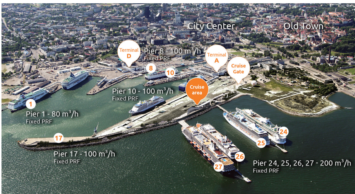
Cruise quays with wastewater reception facilities