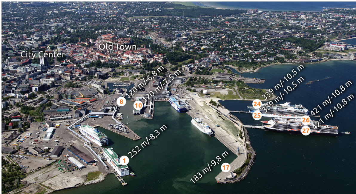
Cruise quays (length and depth EH2000) in Tallinn Old City harbour