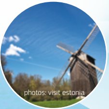
Estonian Open Air Museum